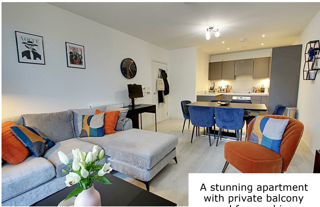
A stunning apartment with private balcony and far reaching views.